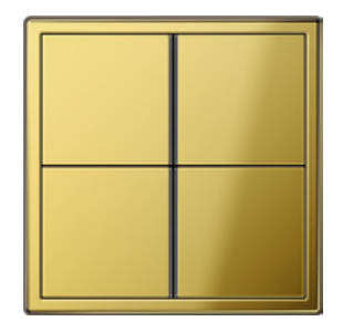
F 40 sensor, 4-gang