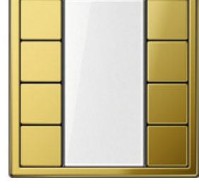
F 50 sensor, 4-gang