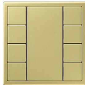
F 50 sensor, 4-gang