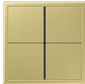
F 40 sensor, 4-gang