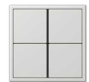
F 40 sensor, 4-gang