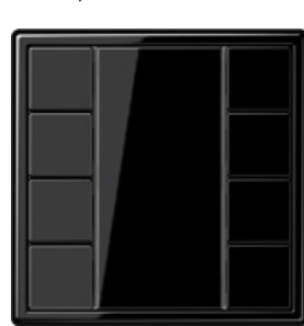
F 50 sensor, 4-gang