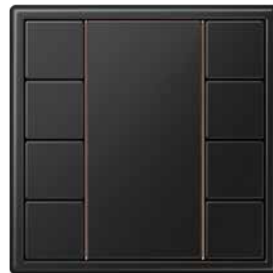
F 50 sensor, 4-gang