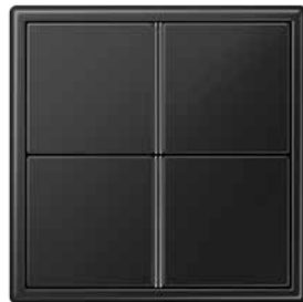
F 40 sensor, 4-gang