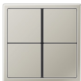
F 40 sensor, 4-gang